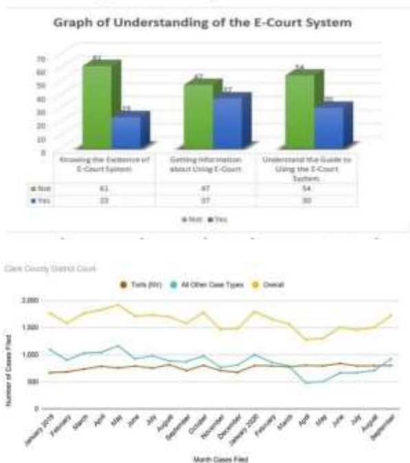
Fig 2:Clark Country District Court 5.CONCLUSION

We have fostered a protected, easy to use Case The executives Programming. This product would ready to save a great deal ofseason of senior promoter as well as representative and client. They don't have to recall that anything. Simply update once. They will get a notice. A promoter can add a client, rivals, Case No., casesubtleties, past hearing date, next hearing date, court name, representative subtleties, and case related record. This product is secure to store information; touchy data is scrambled utilizing cryptography. This can likewise be conveyed/utilized as cloud base programming. As a result, the user can access the system at any time. They simply need web associations, a gadget to interface, and client id and secret phrase.